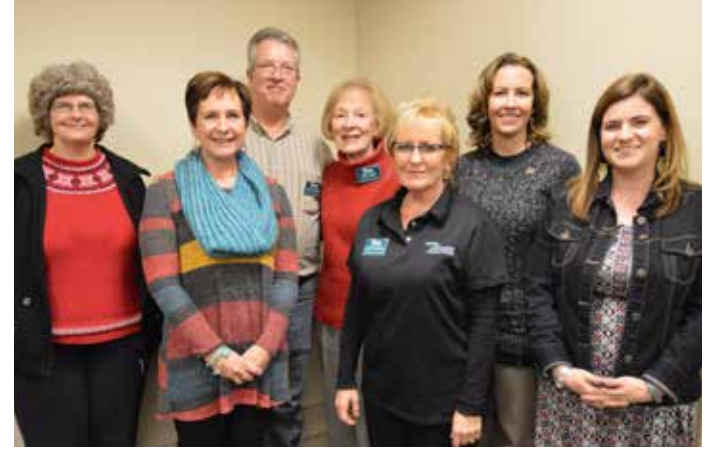
3 Year VIPs